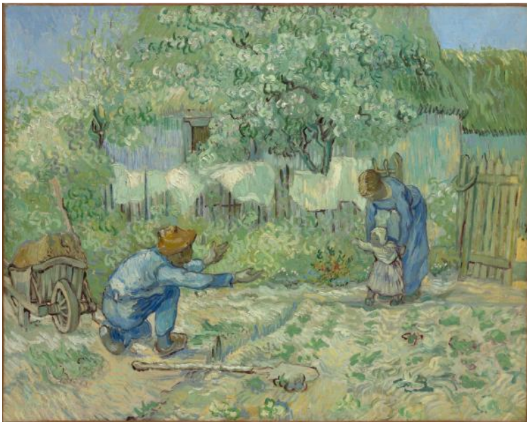
First Steps by Van Gogh, based on Millet